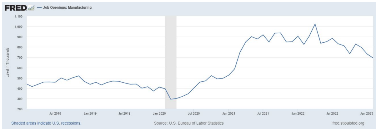
Figure 1. U.S. Manufacturing Job Openings.