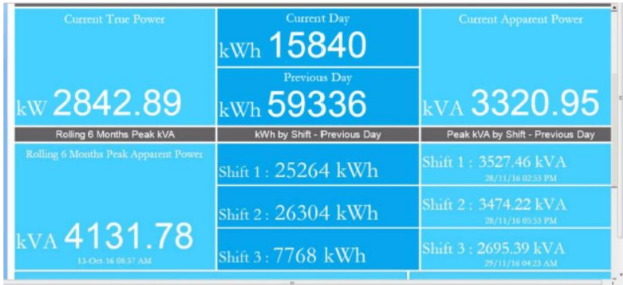
Figure 1 – Example Energy Dashboard depicting essential data for the production of the Facility Performance Indicator (FPI)

The following provides real life examples of a Dashboard (Figure 1) from which the basic information is derived for the Facility Performance Index (Figure 2). In Figure 2 you will see the components of the FPI diagrammatically with production information included.