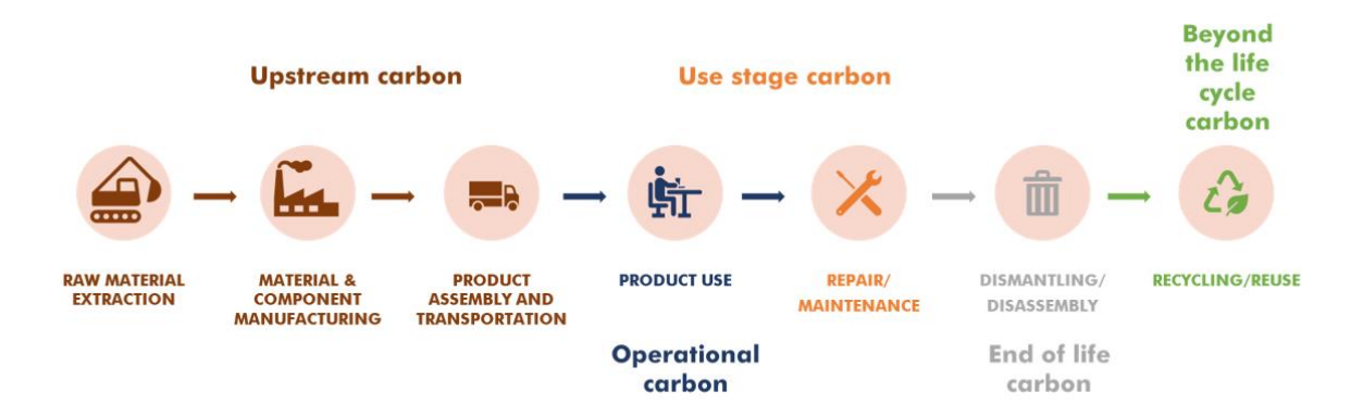
Figure 1. Typical electronic product life cycle.

registered products have reduced GHG emissions by over 184 million metric tons, reduced hazardous wastes by over 830,000 metric tons, and conserved over 208 million metric tons of primary materials (GEC 2021a, EPA 2021a).